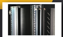
19" Panel Mounting