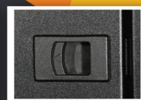
Side Panel Latch