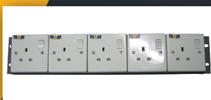
19" 5 Gang Power Distribution