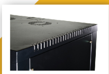
Top Cover Vented Design