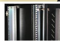
19" Panel Mounting