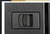
Side Panel Latch