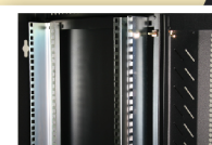
19" Panel Mounting