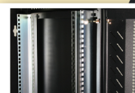
19" Panel Mounting