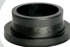
Stub End (Short)