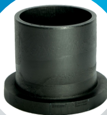
Stub End (Long)