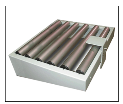
Infeed/Exit Conveyor w/ Stabilizer