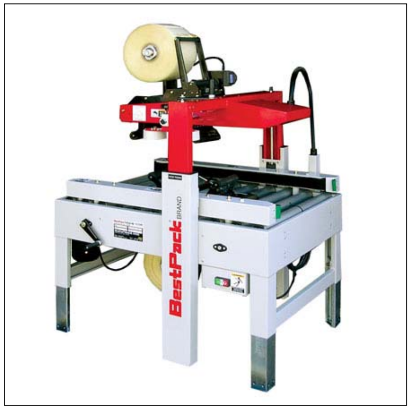
MSD22 Manual Side Drive