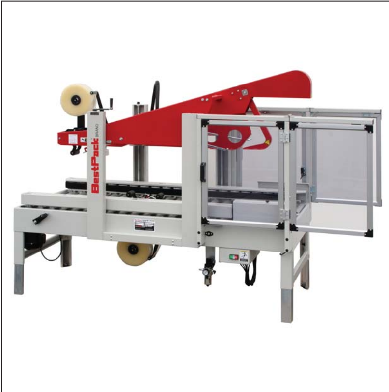
AS Automatic Uniform Sidedrive