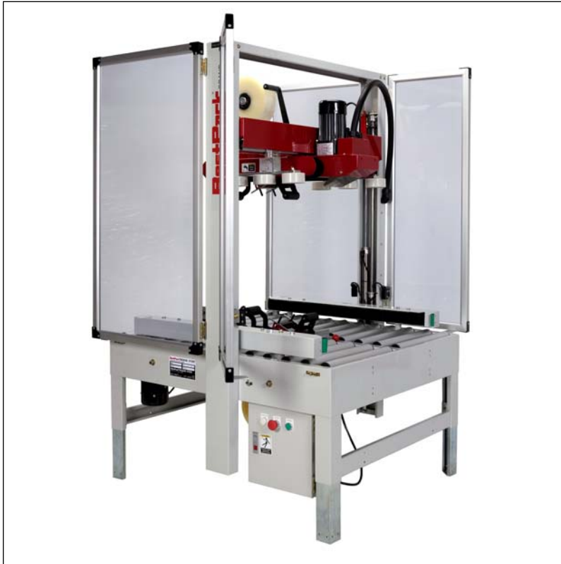
RQ Random Quad Drive