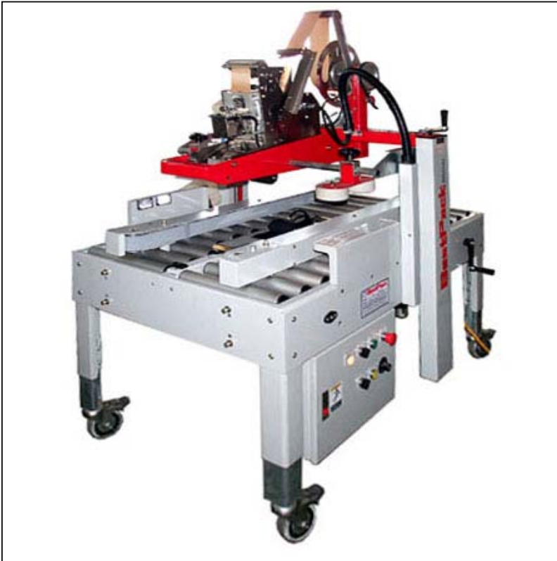
MSD-WA Manual Side Drive Water Activated