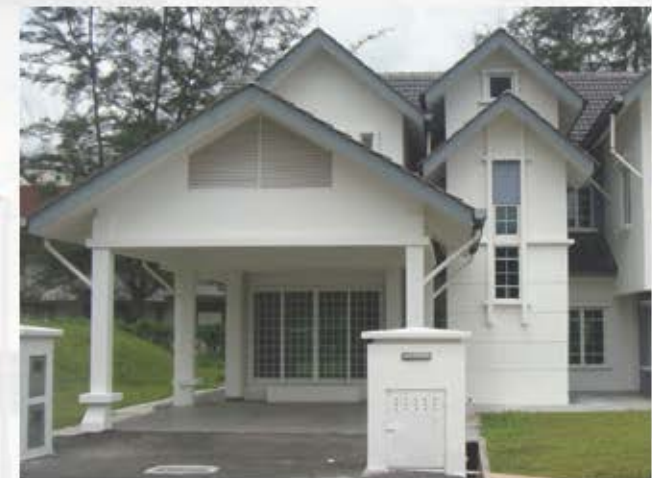
Ibu Pejabat Polis Kontinjen (IPK) Selangor @ Banglo