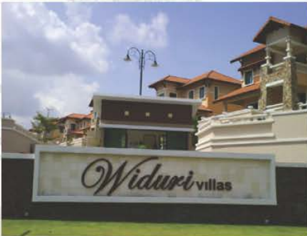
26 unit rumah banglo-link di country height, Mikim Kajang.

2005 | Selangor @ Bungalow Project | Link House | Super Semi - D