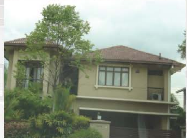
50 units Bungalow Project Phase 1B & 1F