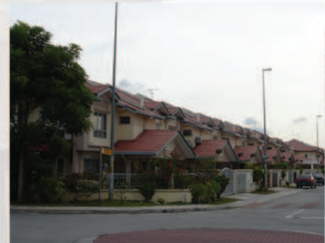
Pembangunan (Fasa 1&A,3) yang Mengandungi 25 Unit Rumah Banglo 2 Tingkat, Bandar Botanic, Klang Bandar Diraja, Selangor Darul Ehsan.