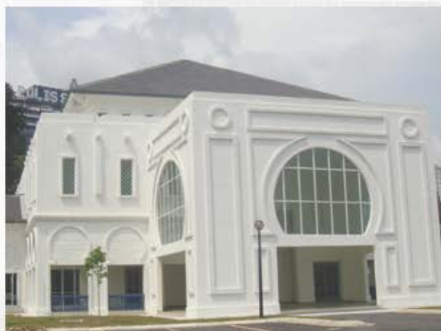
Ibu Pejabat Polis Kontinjen (IPK) Selangor @ Surau

Ibu Pejabat Polis Kontinjen (IPK) Selangor, Ibu Pejabat Polis Daerah (IPD) Shah Alam, 1 unit Banglo Kelas B & 9 unit Baglo Kelas C, Surau, Mess Pegawai, Bengkel, lain-lain Kemudahan Sokongan dan kerja-kerja Infrastruktur yang berkaitan.