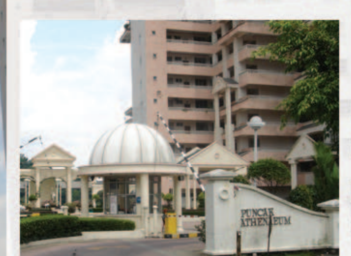
Construction And Completion Of 2 Blocks Of 22 Storey Condominium Comprising 343 Standard Units On Lot 1159, 1160 And 1161, Mukim Of Ulu Klang Daerah Gombak, Selangor.

1993 | Selangor @ Aluminium Window & Glass for Condominium