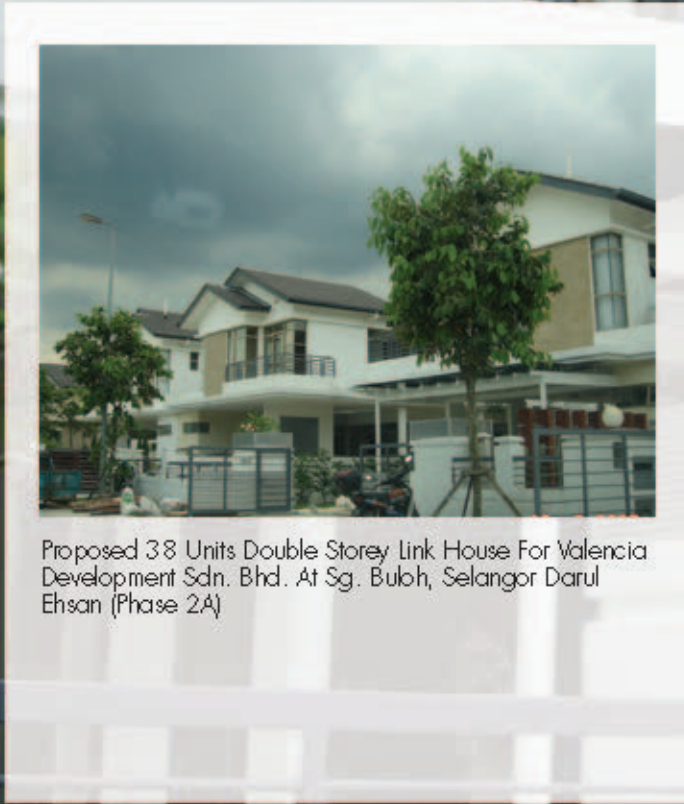
Proposed 38 Units Double Storey Link House For Valencia Development Sdn. Bhd. At Sg. Buloh, Selangor Darul Ehsan (Phase 2A)