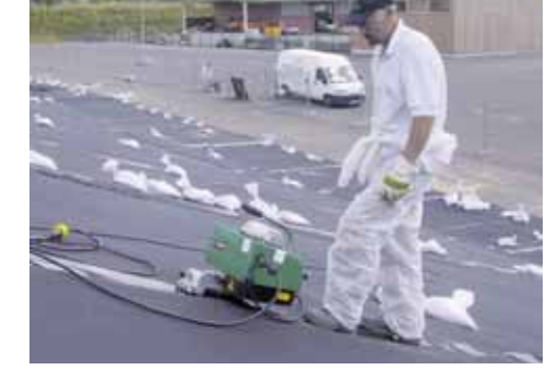
The COSMO in use on a landfill covering.