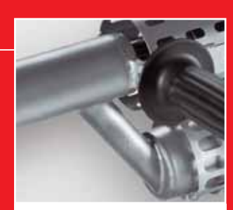
Simple combination of preheating air and plastic heating