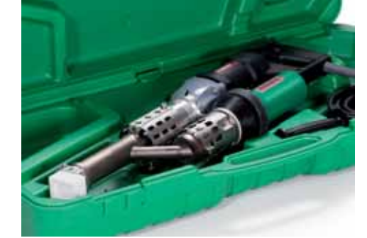
Transport case for Leister hand extruder.