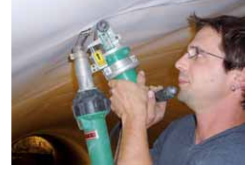
TRIAC DRIVE PID welding overhead in the tunnel construction.