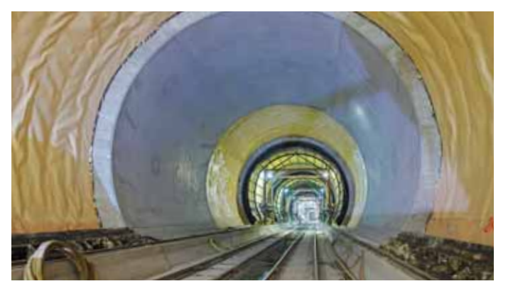
The longest railway tunnel in the world, Switzerland