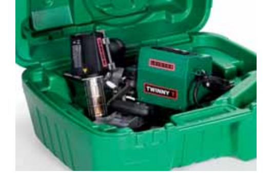
Leister equipment cases suitable for use on building sites.