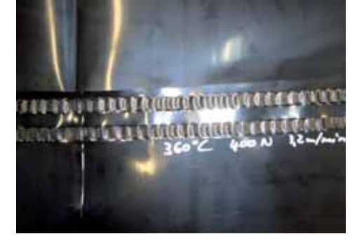
Flawless test welding with the combi-wedge welding machine TWINNY T.