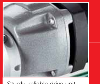
Sturdy, reliable drive unit