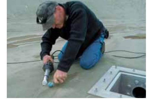
Welding connections using TRIAC PID with push-fit wide slot nozzle.