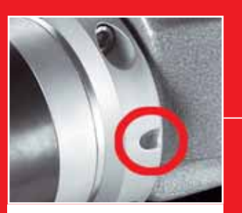
Both sided twist-free wire intake

The FUSION 3 is particularly suitable for hard-to-reach areas.