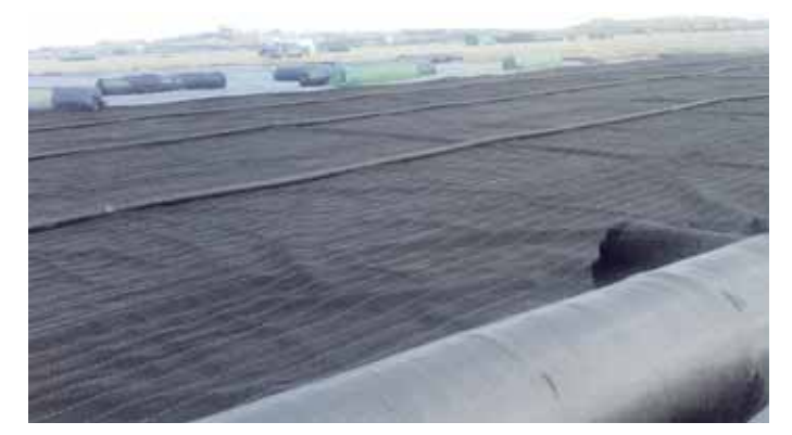
Landfill site in the USA