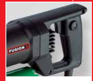
The operating grip lies optimally in the hand.