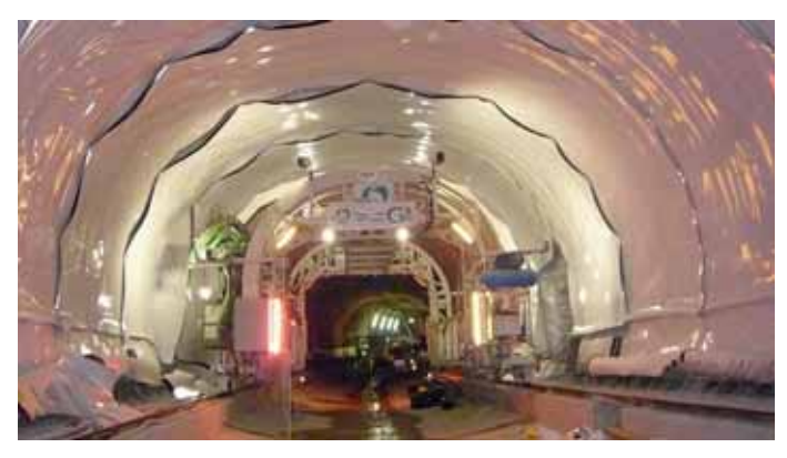
Tunnel construction in Germany