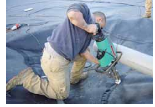
WELDPLAST S6 undertaking assembly applications on a landfill site.