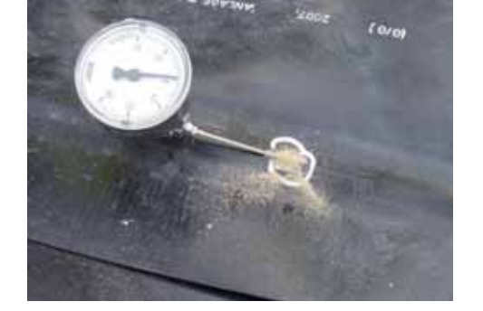
Testing of a welding seam with testing unit and injector needle.