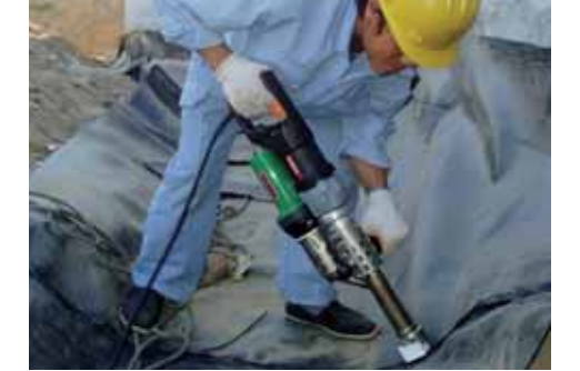
Thanks to its length, the FUSION 3 is particularly suitable for civil engineering applications.