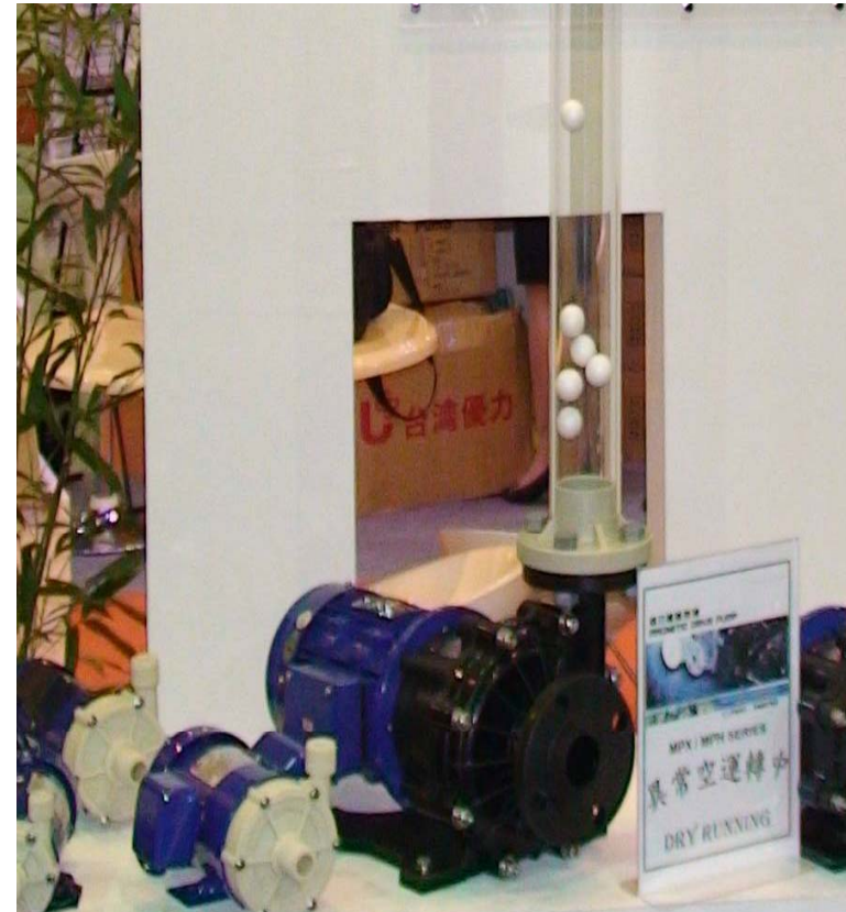
2008 TPCA SHOW 實機空運轉