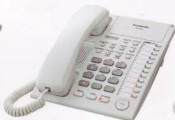
■ KX-T7720 Speakerphone Unit