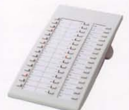
■ KX-T7740 DSS Console