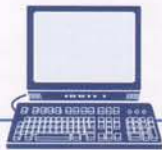
Access to PC