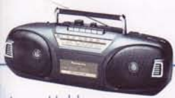
Music on Hold