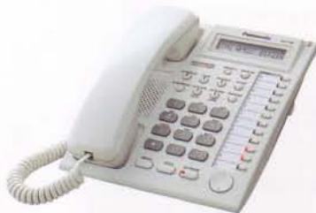
■ KX-T7730 LCD, Speakerphone Unit