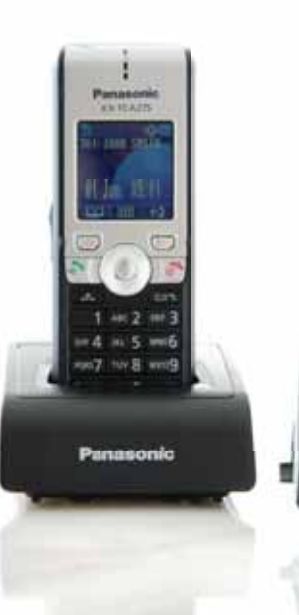
KX-TCA275 Compact Business Model