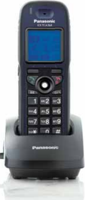
KX-TCA364 Tough Type Model