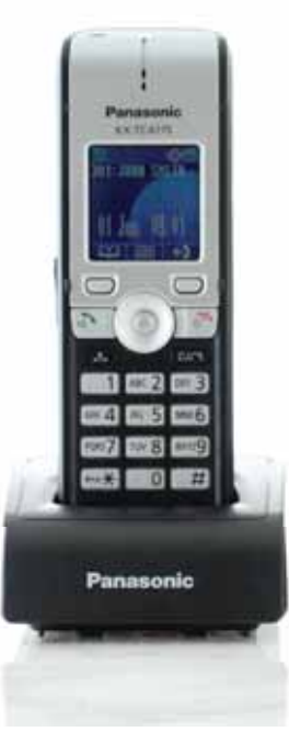
KX-TCA175 Standard Model