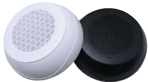
Available in white and black

CS516 is a general purpose ceiling surface mount speaker, suitable for slab mounting. Its dual cone driver delivers good sound reproduction for speech and background music.