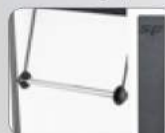
Paper Towel Holder