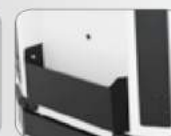
Side Storage Compartment