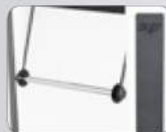
Paper Towel Holder