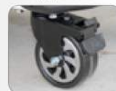
Heavy Duty Wheels

Images are for illustration purposes only, contents may vary.