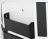
Side Storage Compartment