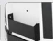
Side Storage Compartment