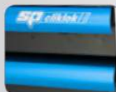
Soft Close Drawers with Locking System