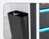
Removable Side Storage/Rubbish Bin