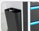
Removable Side Storage/Rubbish Bin