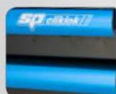
Soft Close Drawers with Locking System