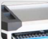
Stainless Steel Work Top