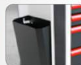
Removable Side Storage/Rubbish Bin