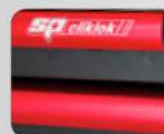
Soft Close Drawers with Locking System