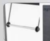
Paper Towel Holder