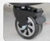
Heavy Duty Wheels

Images are for illustration purposes only, contents may vary.