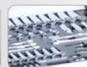
EVA Foam Storage