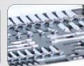
EVA Foam Storage