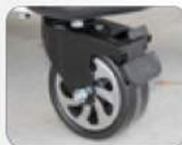
Heavy Duty Wheels