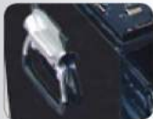
Heavy Duty Carry Handles