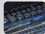
EVA Foam Storage System