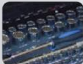
EVA Foam Storage System