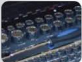
EVA Foam Storage System