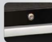
SP Key Locking System