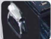
Heavy Duty Carry Handles