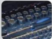
EVA Foam Storage System