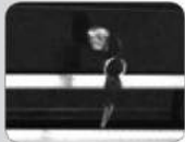
SP Key Locking System