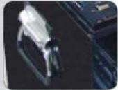
Heavy Duty Carry Handles