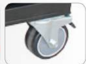
Swivel Wheel with Foot Lock