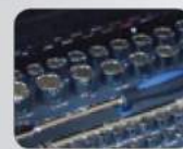
EVA Foam Storage System