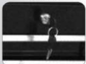
SP Key Locking System