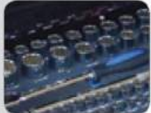
EVA Foam Storage System