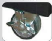
Swivel Wheel with Foot Lock