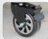
Heavy Duty Wheels