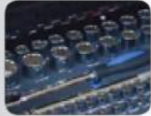
EVA Foam Storage System