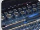
EVA Foam Storage System