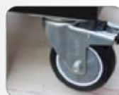
Swivel Wheel with Foot Lock

Images are for illustration purposes only, contents may vary.