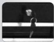
SP Key Locking System