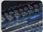
EVA Foam Storage System