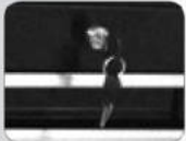
SP Key Locking System