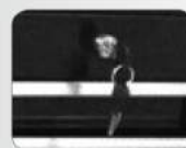
SP Key Locking System