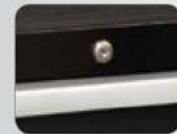
SP Key Locking System