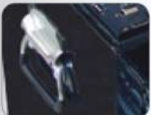
Heavy Duty Carry Handles