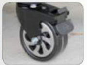
Heavy Duty Wheels