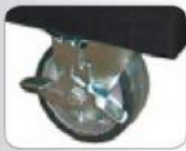
Swivel Wheel with Foot Lock