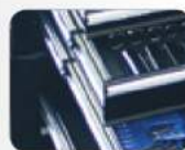
Heavy Duty 28 Ball Bearing Slides