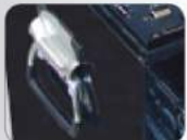
Heavy Duty Carry Handles