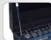
Dual Gas Struts