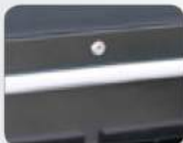
SP Key Locking System