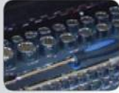
EVA Foam Storage System