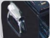
Heavy Duty Carry Handles