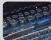
EVA Foam Storage System