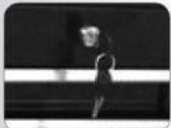
SP Key Locking System