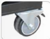
Swivel Wheel with Foot Lock