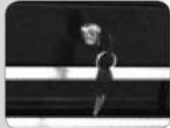
SP Key Locking System