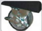
Swivel Wheel with Foot Lock