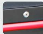
SP Key Locking System