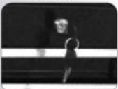
SP Key Locking System