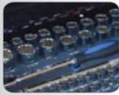
EVA Foam Storage System