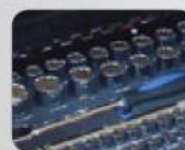
EVA Foam Storage System