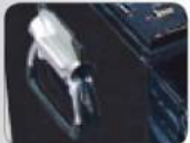
Heavy Duty Carry Handles