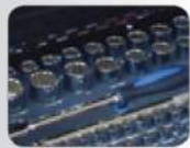
EVA Foam Storage System