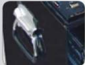
Heavy Duty Carry Handles