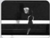
SP Key Locking System