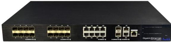
(SFP Fiber Optic Module Not Included)