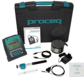
353 10 300 unit G