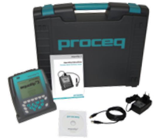
353 10 050 basic unit