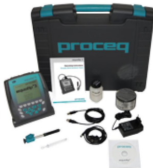
353 10 100 unit D

Equotip3 indicating device, AC adapter, carrying case, USB-cable, Equotip CD, operating instructions and quick reference guide. The customer needs to buy the appropriate impact device and test block in addition to the Equotip 3 basic unit