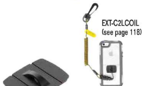
EXT-C2LCOIL (see page 118)