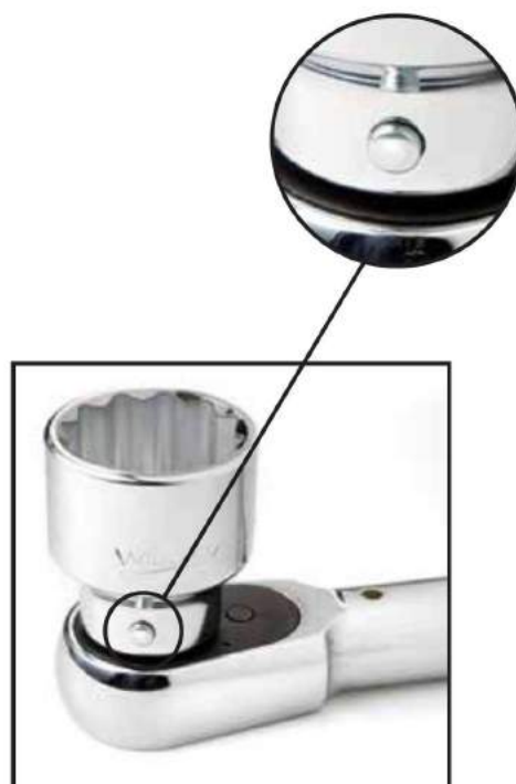
Socket-Lok® button positively locks the socket and drive tool together, providing positive retention and quick disassembly.