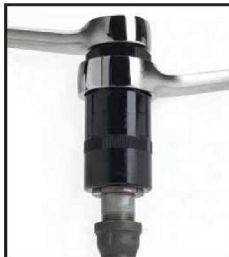
The Tight-Grip Nipple Tool in use. One wrench holds the housing in place while the other wrench turns the top nut, clamping the collet and housing assembly onto the nipple. The housing, collet, and nipple then turn as one.