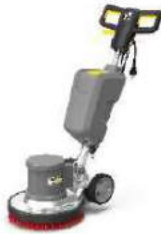
BDS 43/150 C Classic *IN