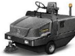
KM 120/250 R D Classic