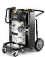
IVC 60/24 - 2 Ap