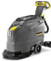
BD 43/40 Classic EP