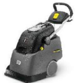
BRC 45/45 C Ep