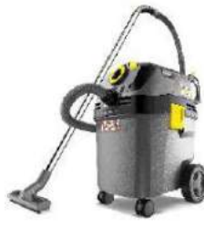
NT 40/1 Ap L