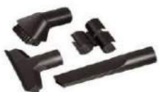
Vacuum Tool Kit