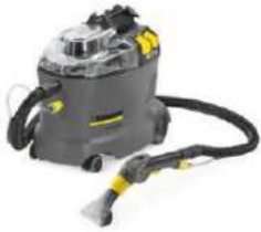
Puzzi 8/1 C