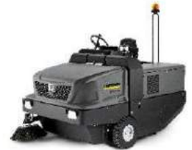
KM 150/500 Classic