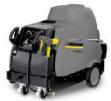
HDS 2000 Super