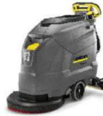
BD 50/60 Classic EP