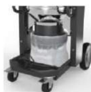
Longopac Disposal System