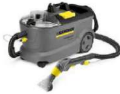
Puzzi 10/1 *Eu