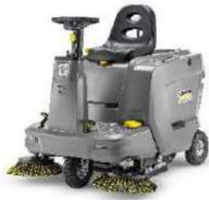
KM 85/50 R Bp