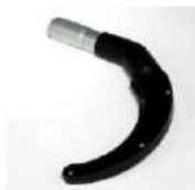
Pipe Cleaning Nozzle