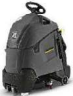
BD 50/40 RS Bp