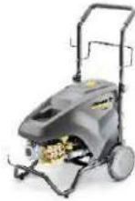
HD 9/20-4 Classic