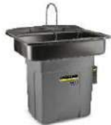
PC 100 M2 BIO