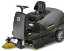
KM 100/100 R P