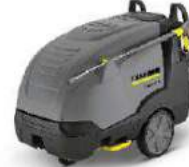
HDS 10/20-4M Eco