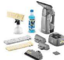
WVP 10 Adv