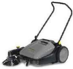
KM 70/15 C