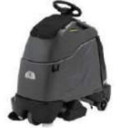
CV 60/2 RS