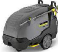
HDS 8/16 - 4 kW - 4 E (12/24/36 kW)