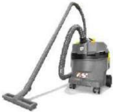
NT 22/1 Ap L