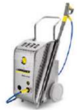
HD 10/15-4 Cage Food