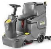
BD 50/70 Bp Classic