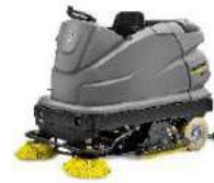
B 250 R Bp