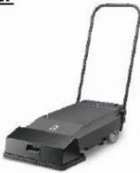
BR 45/10 Esc