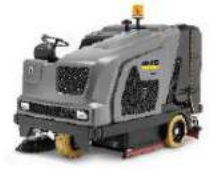
B 300 RI