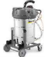
IVR-L 100/24-2 Tc Me