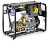
HD 7/16 - 4 Cage Classic