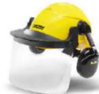
Safety helmet with hearing protection & visor