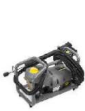
HD 5/11 Cage