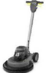
BDP 50/1500 C