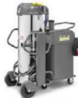
IVS 100/75 M