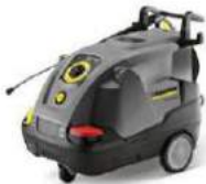
HDS 8/18-4 C