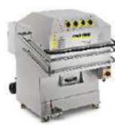
PC 60/130 T