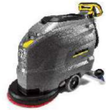
BD 50/50 Classic