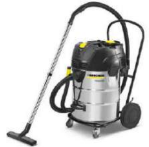
NT 75/2 Ap Me TC