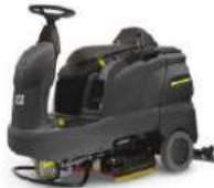
B 90 R Bp