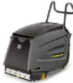
BR 47/35 Esc