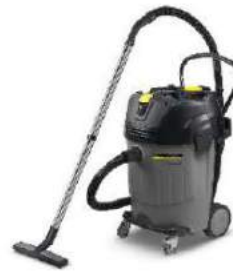
NT 65/2 Ap