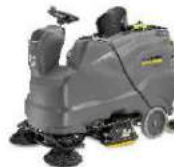
B 150 R Bp