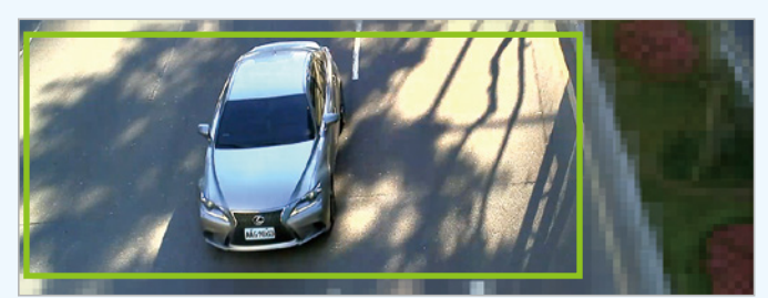
Smart Stream - Manual Mode