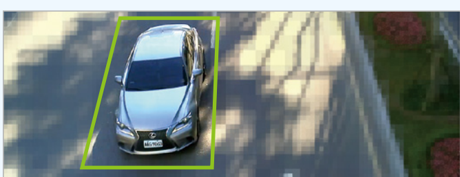
Smart Stream - Auto Mode