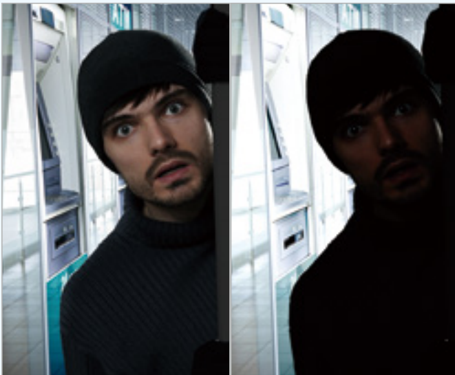
With WDR Pro