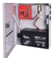
NVS1230P Power Supply