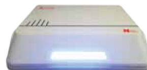
Blue Successful read card