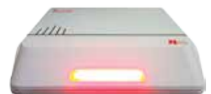
Red Power on