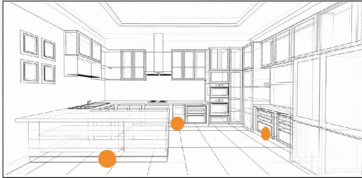
● Spot Treatment