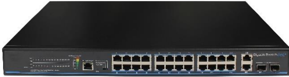
(SFP Fiber Optic Module Not Included)