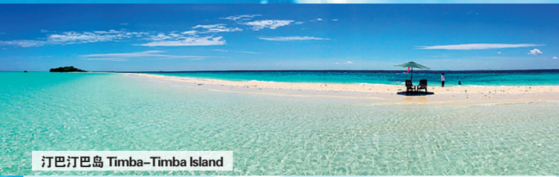
汀巴汀巴岛 Timba-Timba Island