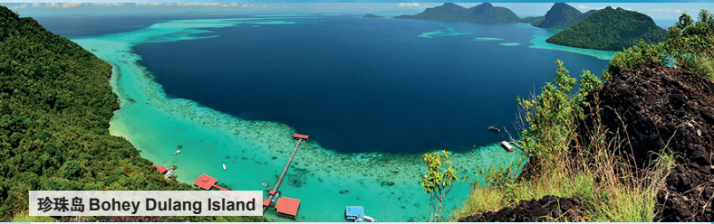
珍珠岛 Bohey Dulang Island