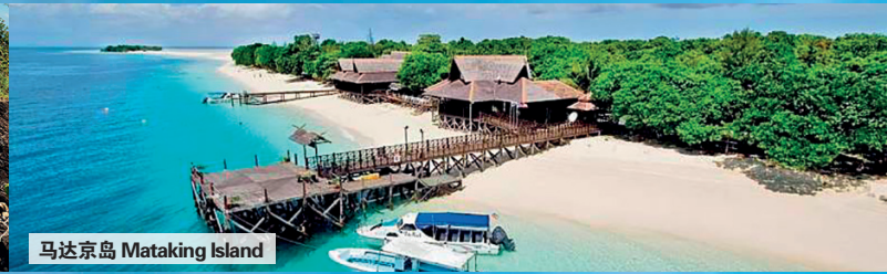
马达京岛 Matak Island