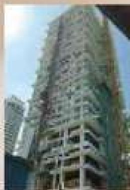
Sunrise Tower, Gurney Drive by Primo Corporation Sdn Bhd