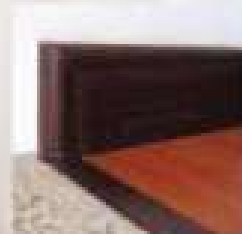
MDF / PVC Skirting