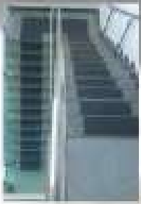
Toray Plastik (Malaysia) Sdn Berhad