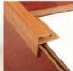
PVC Stair Nose (F)