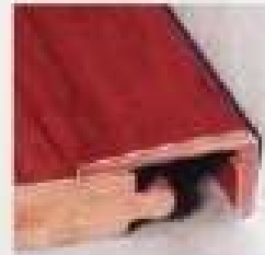
PVC END Border L