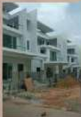
Hillpark Residences by Sunrise Manner