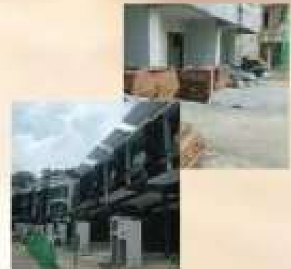
Ghee Hiang Garden, Gelugor by Six Eleven Assets Groups Sdn Bhd