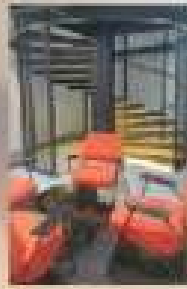
Anap Jurunding Sdn Bhd at Paragon office, Penang