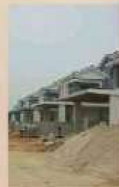
Taman Perdana, Simpang Ampat Project by JMR