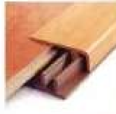
PVC END Border Click