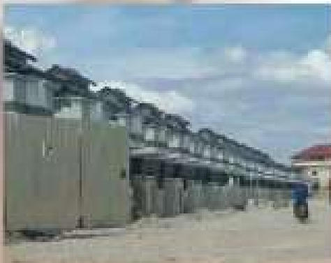
32 unit Rumah Teres 2 Tingkat At Kepala Batas (Bertam) by Jamil Ghani Construction Sdn Bhd