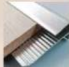
Aluminium Stair Nose (F)