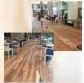
ParkRoyal Hotel Penang