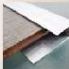
Aluminium END Border J