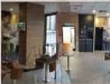
McDonald's Restaurants at Jalan Tengah, Penang