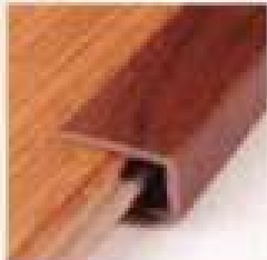
PVC End Border J