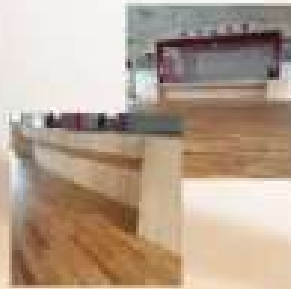
SK (C) Jt Sm A & B School Bukit Mertajam