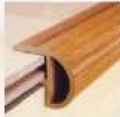
PVC Stair Nose Round