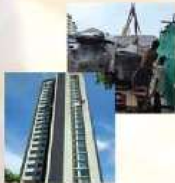
The Penthause by Tamarins