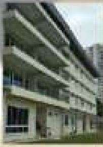
Dalul International School Tanjung Bunga, Penang