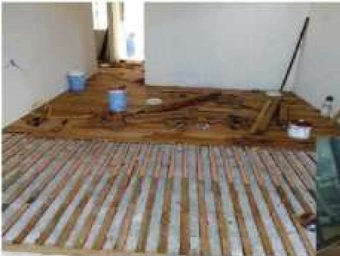
Installation with using battarn