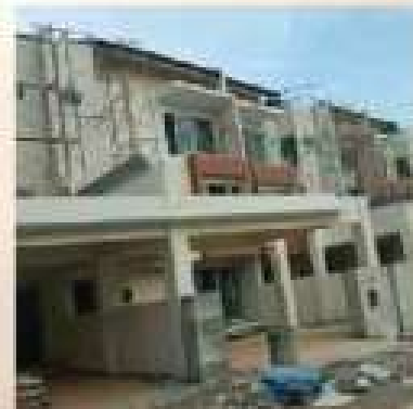
Island View Project, Batu Uban by Chong Company