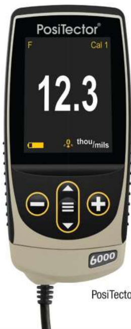
PosiTector 6000 F45S1