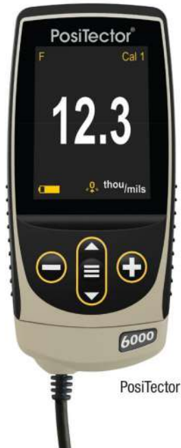
PosiTector 6000 FLS1