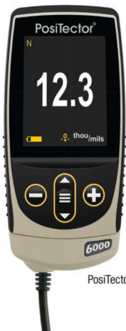
PosiTector 6000 NRS1