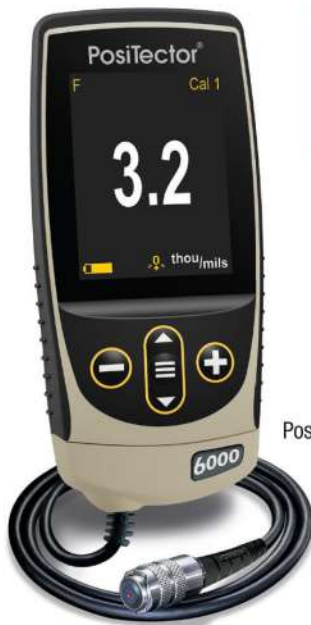
PosiTector 6000 FNS1