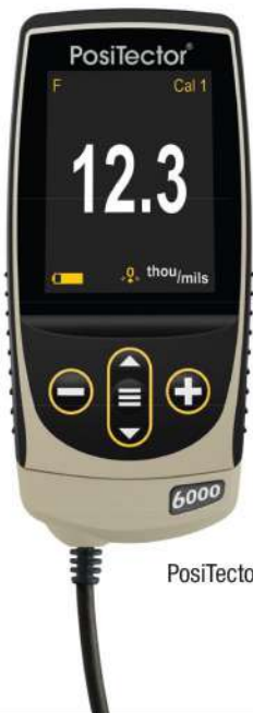
PosiTector 6000 FNRS1