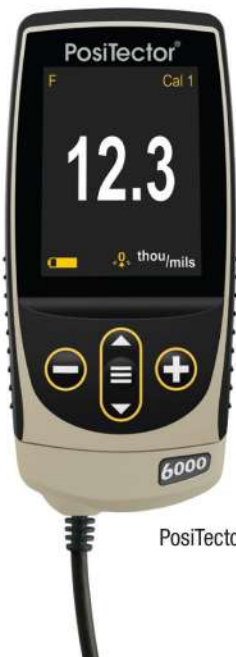
PosiTector 6000 FRS3