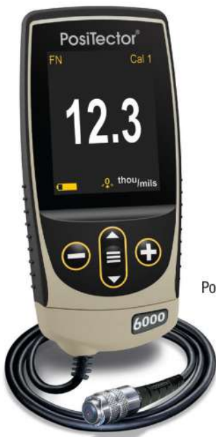
PosiTector 6000 FTS3