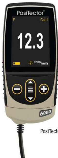
PosiTector 6000 FHXS3