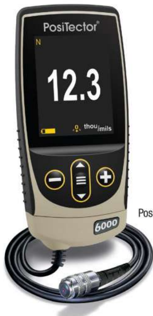
PosiTector 6000 NS3