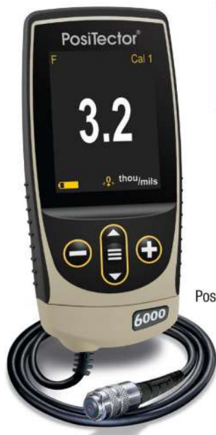
PosiTector 6000 FNS3