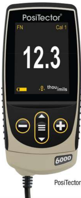
PosiTector 6000 FNTS3