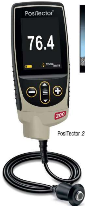
PosiTector 200 C1