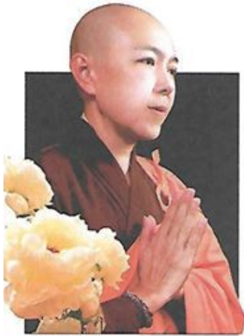
宗教法師 Buddhist Mantra

宗教法師們以誠心的誦經猶如淨心的明燈，引導著他/她回向西方的極樂世界。 The Buddhist Mantra will guide him/her to the Land of Eternal Bliss in the West.