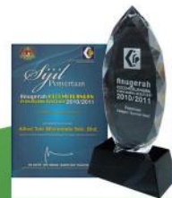
KECERMELANGAN PERNIAGAAN BERETIKA MINISTRY OF DOMESTIC TRADE MALAYSIA 2010