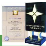
INTERNATIONAL GOLD STAR FOR QUALITY AWARD (ISAD) GENEVA 2008