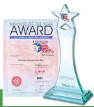
EMERGING COMPANY BUSINESS OF THE YEAR MALAYSIA 2005