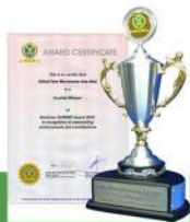
CRISTAL WINNER BUSINESS SUMMIT MALAYSIA 2007