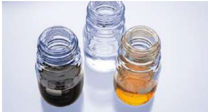
CHEMICALS AND PETROLEUM PRODUCTS

Depending on the viscosity of your sample, you may either choose the L-model for low-viscosity samples, R-model for medium-viscosity (regular) samples, or H-model for high-viscosity samples.