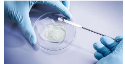
COSMETICS & PHARMACEUTICALS