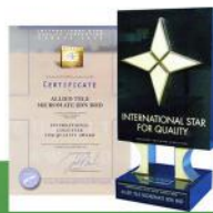
INTERNATIONAL GOLD STAR FOR QUALITY AWARD (ISAD) GENEVA 2008