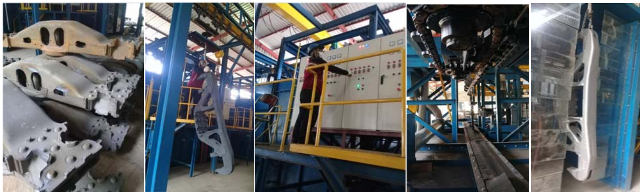
Pics Bogie Bolster - Loading Side Frame - Control Station - Trolley Conveyor & Drives - Completed Finishes