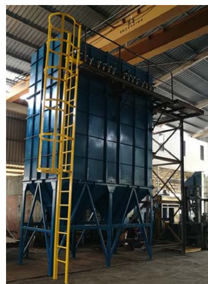
Filter Bag Type Dust Collector