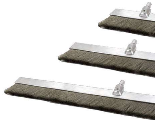
Flat Wire Brush Electrodes

Use spring and brush electrodes made by other manufacturers with DeFelsko adaptors: