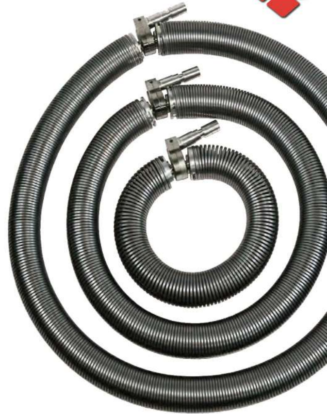
Rolling Spring Electrodes