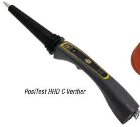
PosiTest HHD C Verifier