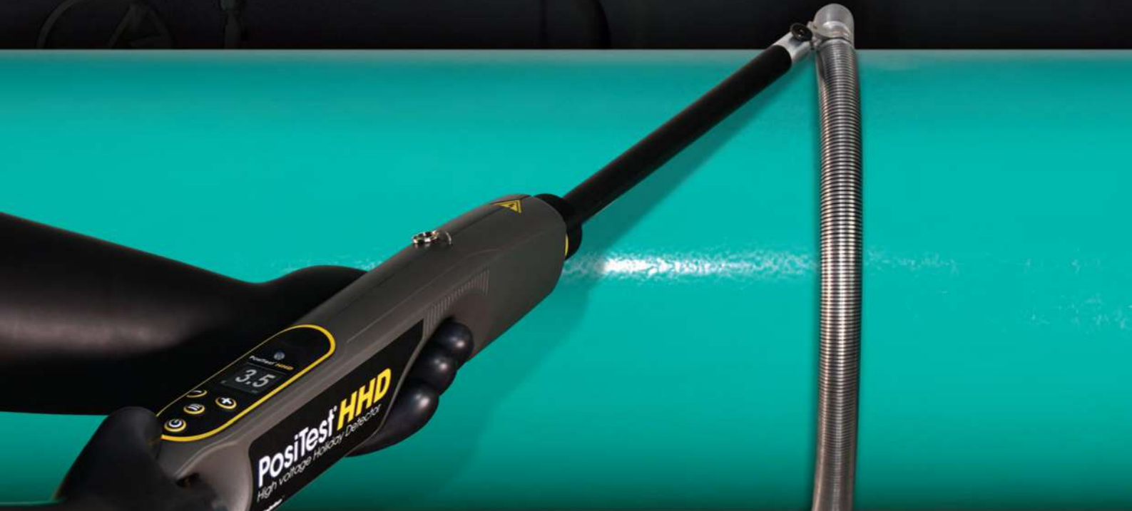
PosiTest HHD shown with optional spring electrode

Detect holidays, porosity, pinholes, leaks, and other discontinuities