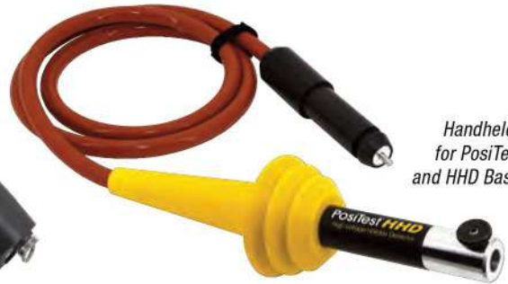
Handheld Wand for PosiTest HHD and HHD Basic only