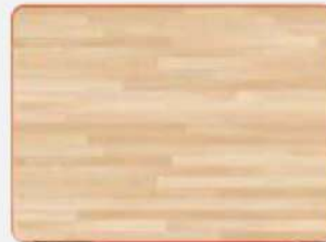
CHESTNUT WOOD BENCH TOP 1472K-ACTW