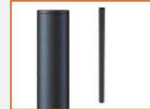
REMOVABLE GUIDING POLE LONG 1477K-AC28