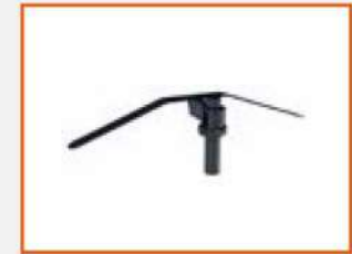
JACKET HOLDER 1477K-AC17