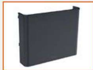
DOCUMENT HOLDER 1477K-AC19