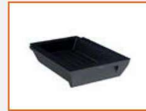
BOTTOM DRAWER 1477K-AC10