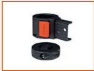
SOLID CLAW AND RING MOUNTING 1477K-AC11