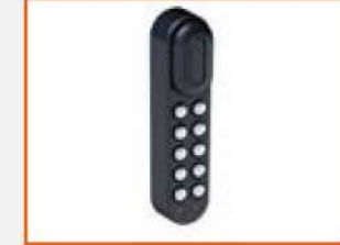
PIN CODE LOCKING SYSTEM 1477K-AC24