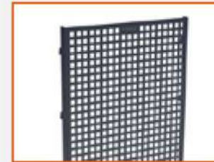
SIDE TOOL PANEL 1477K-AC22