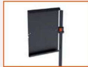
WORK DOCUMENT BOARD 1477K-AC14