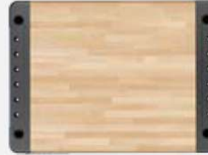
CHESTNUT WOOD BENCH TOP 1477K-ACTW