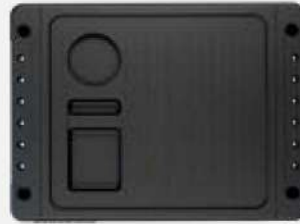
COMPOSITE BENCH TOP 1477K-ACTP

You can add various Bahco Xpand accessories to the Storage HUB which simplify the project while improving efficiency and work safety.