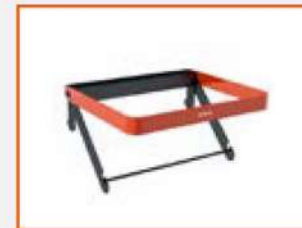
ROLL HOLDER 1477K-AC18