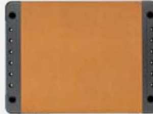
MDF BENCH TOP 1477K-ACTD