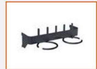
POWERTOOL HOLDER 1477K-AC21