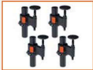
WINDSHIELD SUPPORTS 1477K-AC16