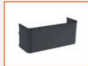
SPRAY CANISTER HOLDER 1477K-AC20