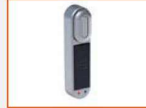
MIFARE LOCKING SYSTEM 1477K-AC25