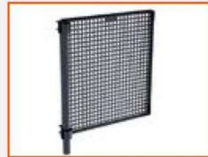
TOP SIDE TOOL PANEL 1477K-AC13