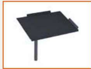
LAPTOP BOARD 1477K-AC15