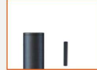
REMOVABLE GUIDING POLE SHORT 1477K-AC29