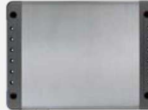
STAINLESS STEEL BENCH TOP 1477K-ACTSS