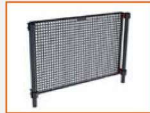
TOP TOOL PANEL 1477K-AC12