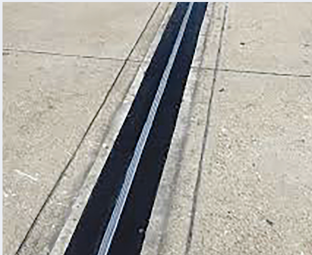
Emcrete expansion joint patching and nosing material